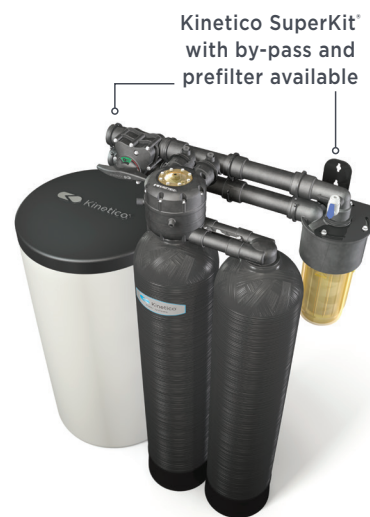
Model Shown: 2060s

Platinum 10 Year Limited Warranty: Enjoy years of dependability and peace of mind with one of the most comprehensive warranties in the industry.