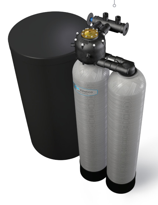
Model Shown: 735